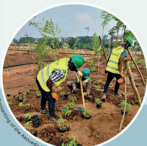
Replanting of the Akouedo landfill – Ivory Coast