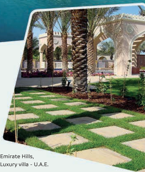
Emirate Hills, Luxury villa - U.A.E.