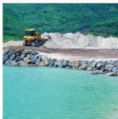
Erosion control – Moorea – French Polynesia