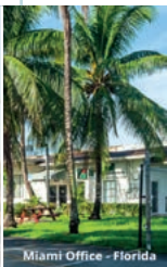
Miami Office - Florida