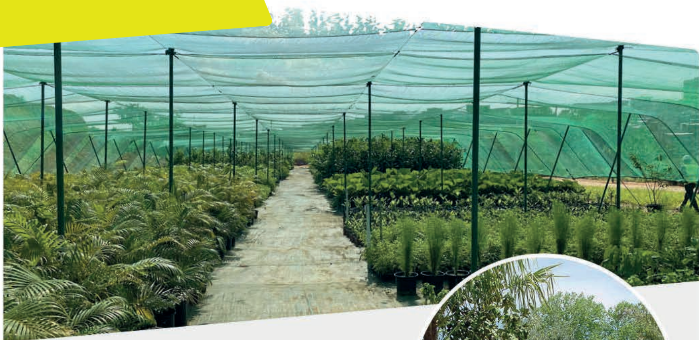
Akouedo - Ivory Coast