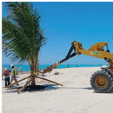
Planting – Ocean Cay Island – Bahamas