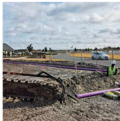
Highways and external works – Jacksonville – USA