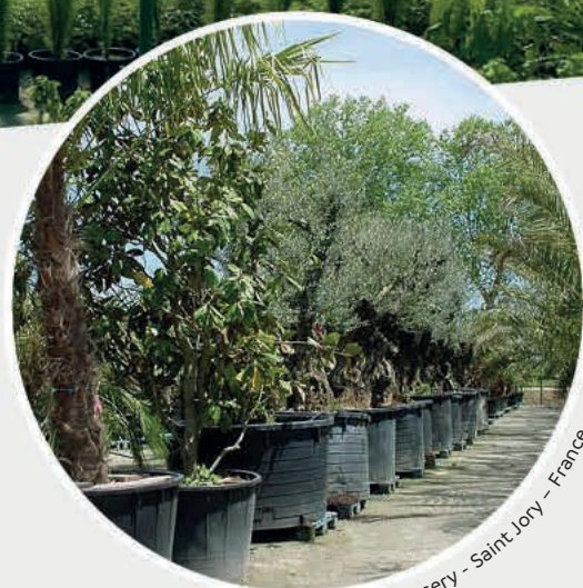
Gregori International Nursery - Saint-Jory - France