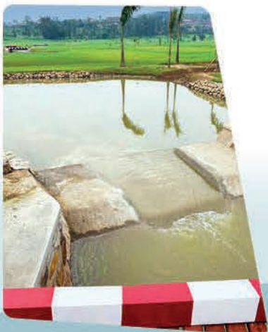
Hydraulic works for storm water management Kigali Golf Course – Rwanda