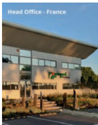
Head Office - France

Our presence - Our teams Our equipment - Our mobility