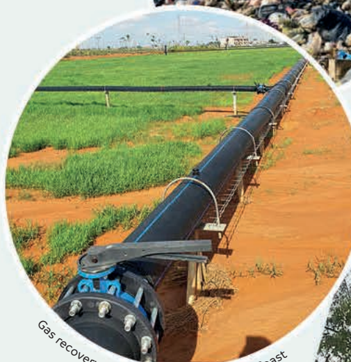
Gas recovery network – Akouedo – Ivory Coast