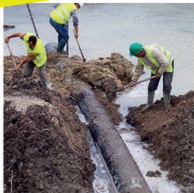
Hydraulic works – Tangier – Morocco

EXPERT IN ENVIRONMENTAL ECOLOGICAL SOLUTIONS