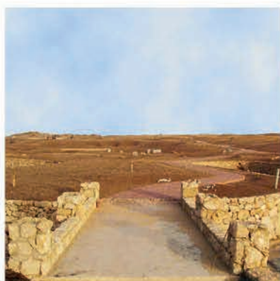
Masonry works – Golf course pathway – Morocco