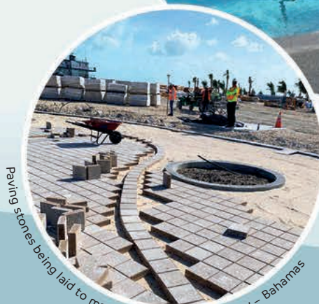
Paving stones being laid to make a pathway - Ocean Cay - Bahamas