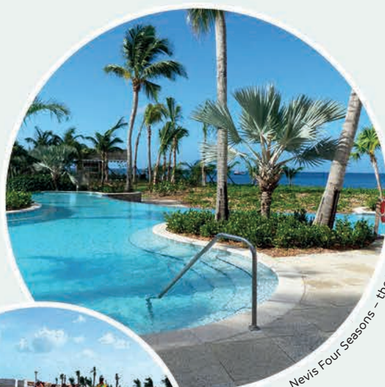
Landscaping - Nevis Four Seasons - the West Indies