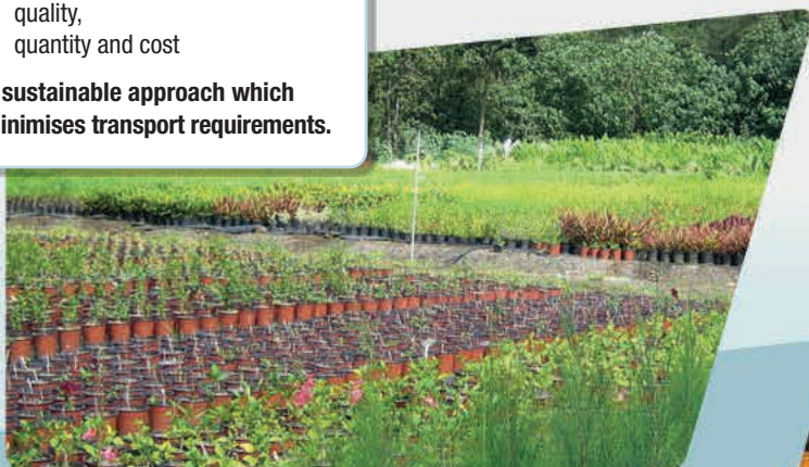
Nursery at the Moorea Green Pearl Golf Course French Polynesia