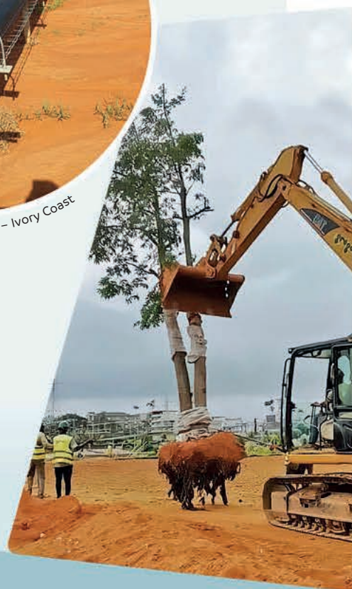
A tree being transplanted