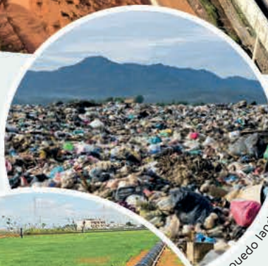
Akouedo landfill – Ivory Coast