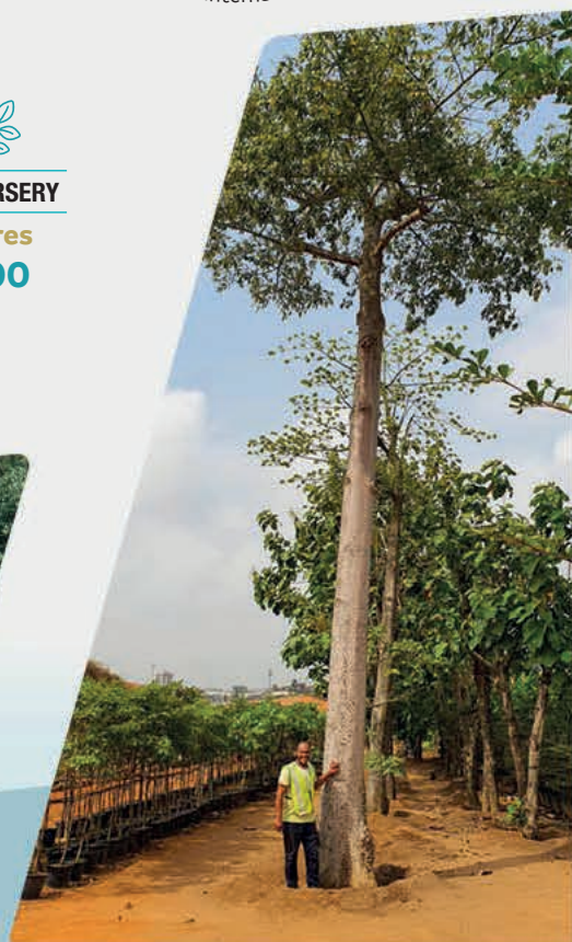
Akouedo nursery - Ivory Coast