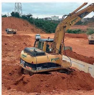
Excavation works – Abidjan – Ivory Coast