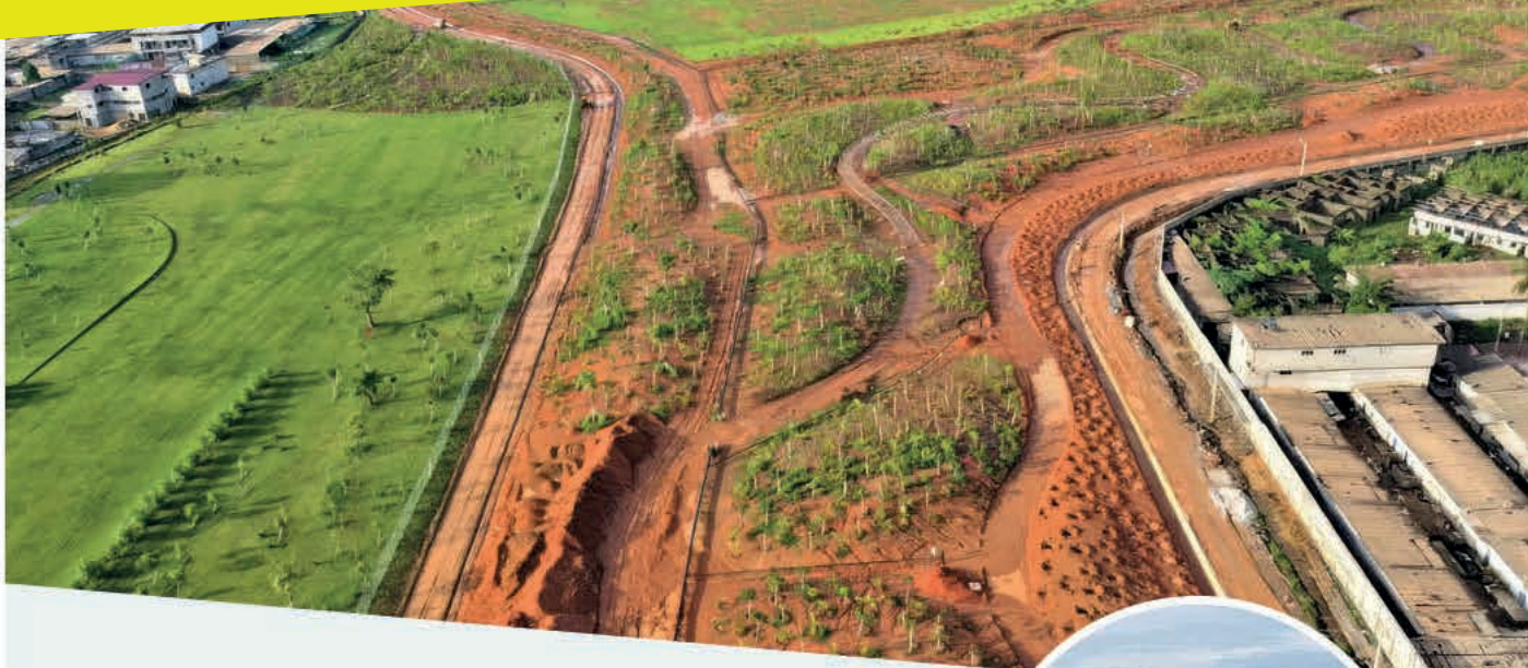
Akouedo – Ivory Coast