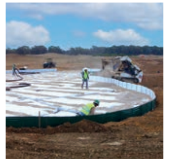
Construction of greens