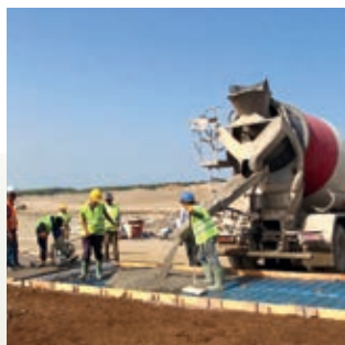
Pathways and utilities