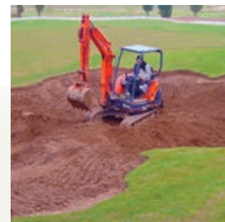
Construction of bunkers