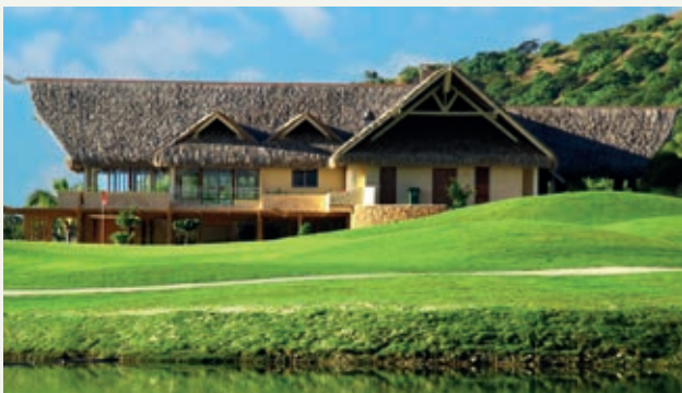
MOOREA GREEN PEARL GOLF COURSE

As the client's single source, Gregori International is responsible for coordinating the building architect, interior decorator, design office, kitchen designers and engineering office for the construction of club houses.