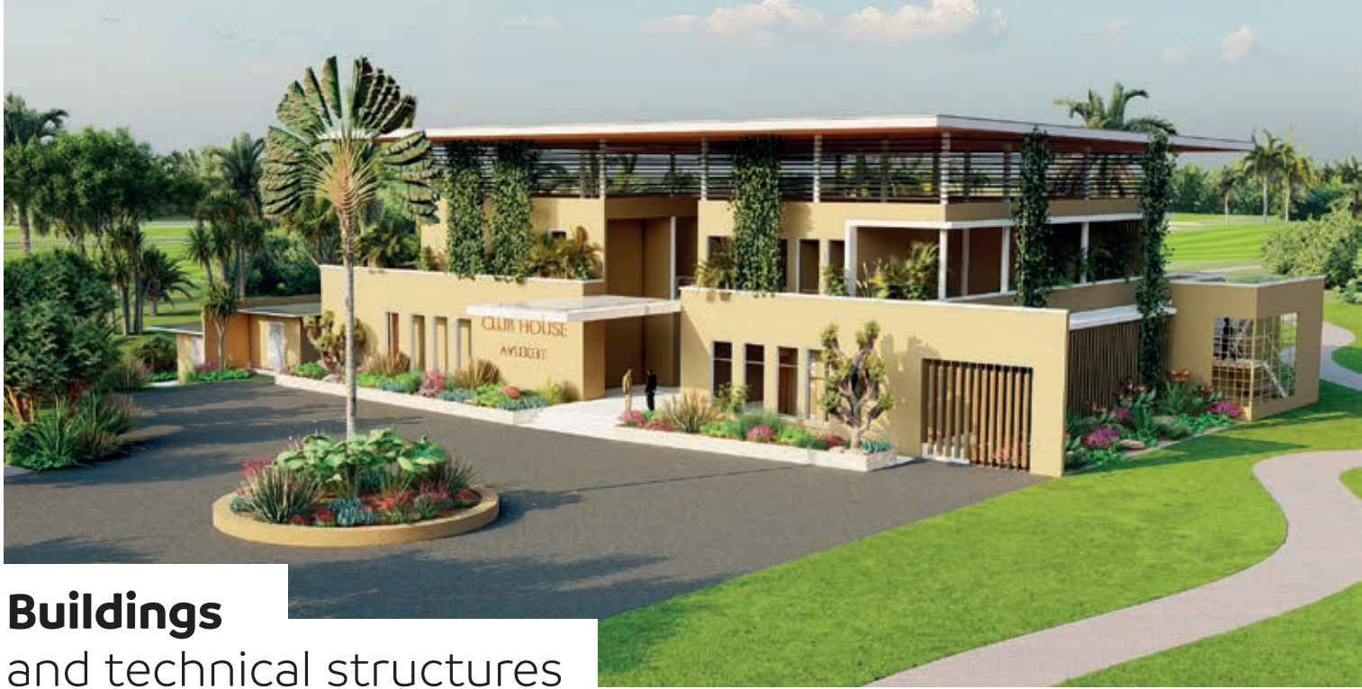
AVLEKETE CLUB HOUSE, BENIN