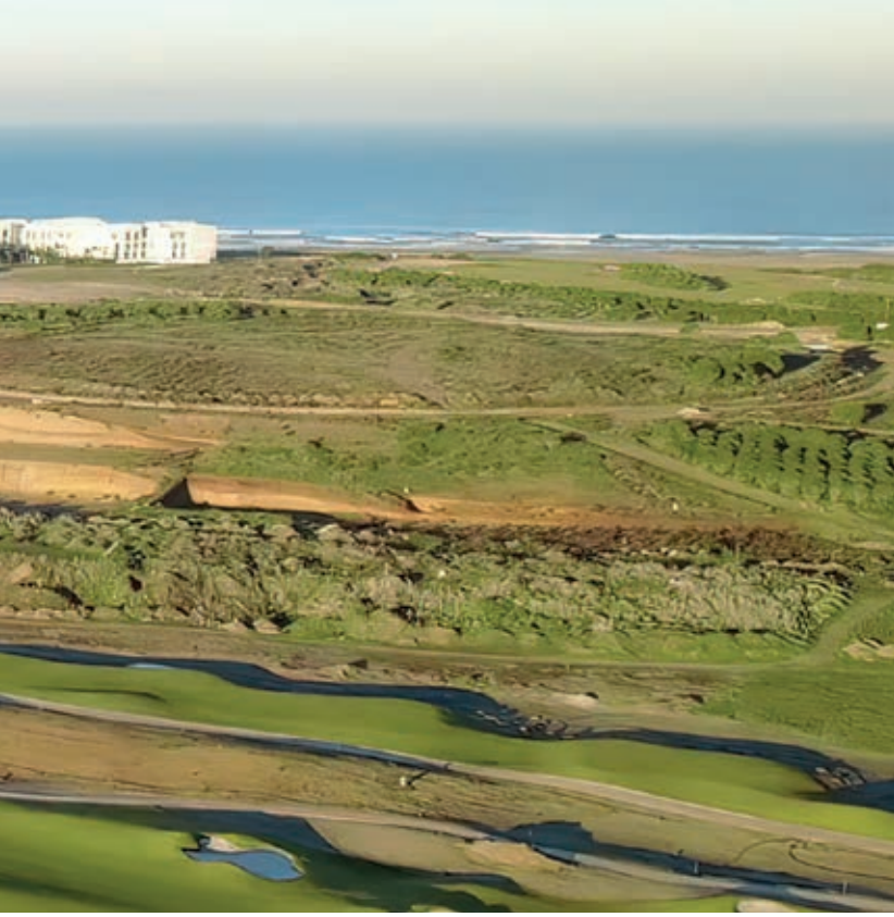
AL HOUARA GOLF COURSE, MOROCCO