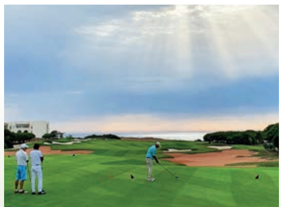
AL HOUARA GOLF COURSE, MOROCCO