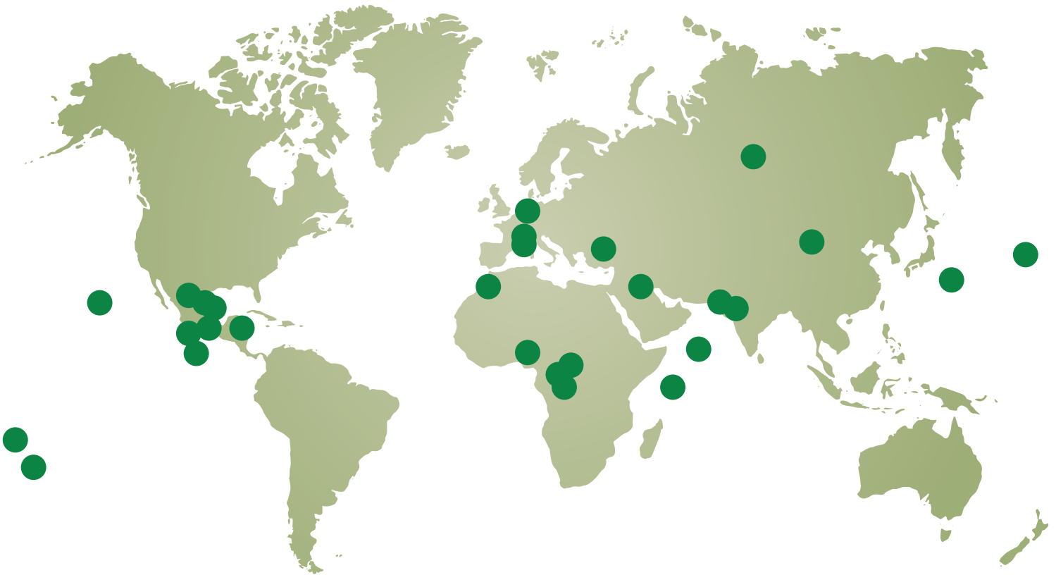
MOOREA GREEN PEARL GOLF COURSE, TAHITI, FRENCH POLYNESIA