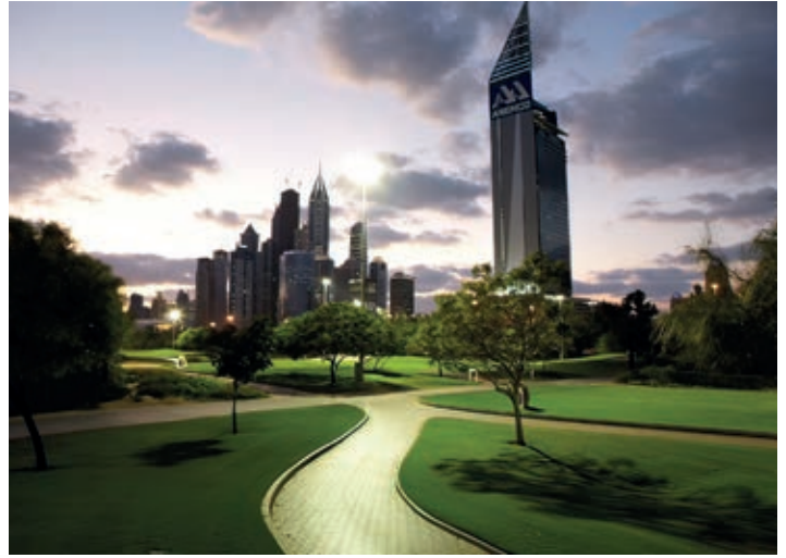
WADI COURSE EMIRATES GOLF CLUB, DUBAI, UNITED ARAB EMIRATES