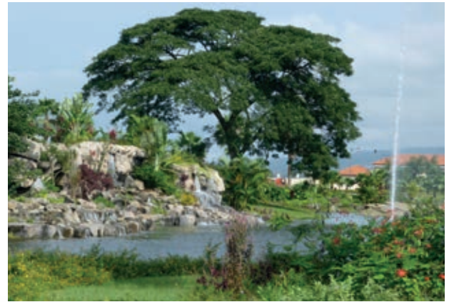
DESIGN AND CONSTRUCTION OF CASCADE