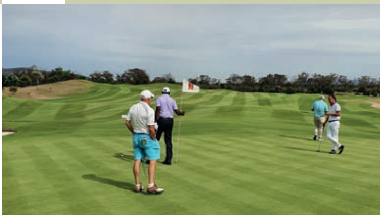
AL HOUARA GOLF COURSE, MOROCCO

Depending on the nature of the project: Championship course, Resort course, property development, etc. and the targeted client category, we will be able to make recommendations for the golf course architect.