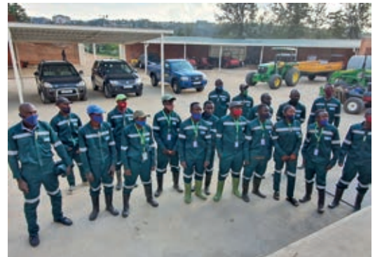
TEAM MAINTENANCE, KIGALI