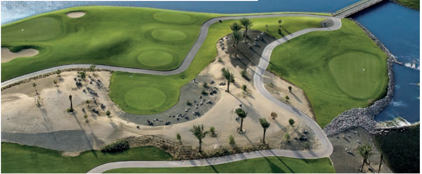
AL BADIA GOLF COURSE, DUBAI

Gregori International is one of the few companies to create turnkey golf courses.