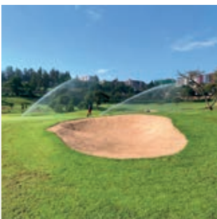
Grow in: monitoring growth